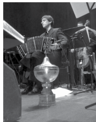
The winner of the Concorso 2008

With the professional jury the Concorso stands for quality and realises a selection in tangogroups and musicians. With music masterclasses organised in the doble ocho festival we try to supply a further stimulation to these talents. To make it affordable, the participation of the Concorso and the masterclass is free for music students. In the near future the Doble Ocho organisation intends to motivate regional music schools to participate in the Concorso and stimulate them to give more space to tangomusic in their educational programme.